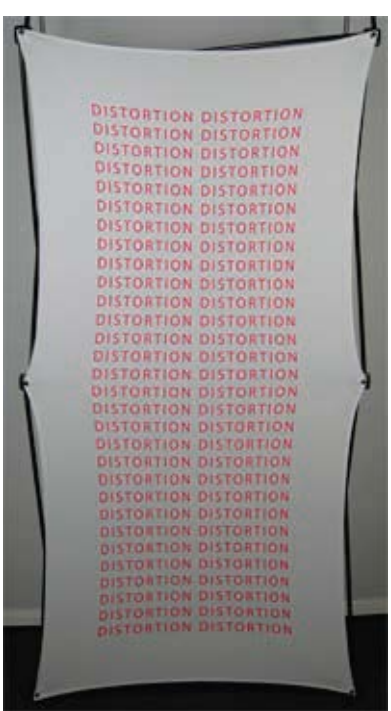
5" in - least amount of distortion