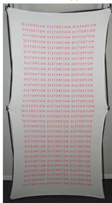
3" in - distortion becomes more apparent