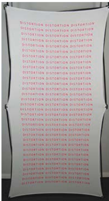
3" in - distortion becomes more apparent