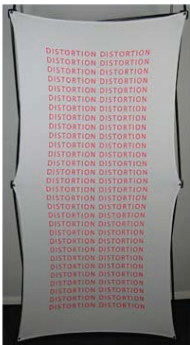
5" in - least amount of distortion