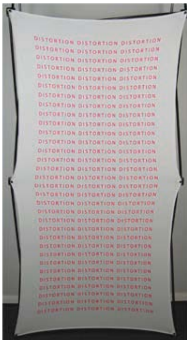
3" in - distortion becomes more apparent