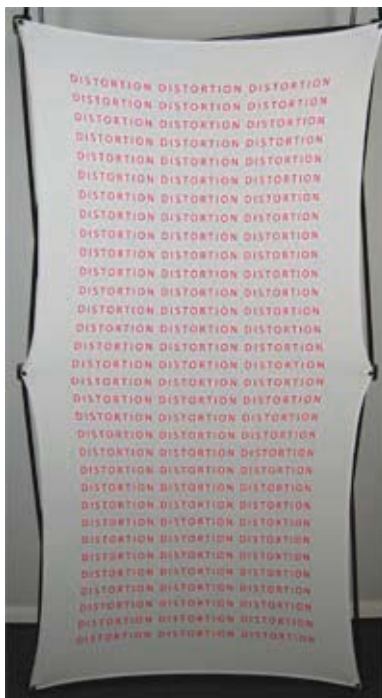
3" in - distortion becomes more apparent